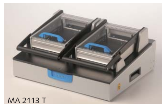
MA 2113 T